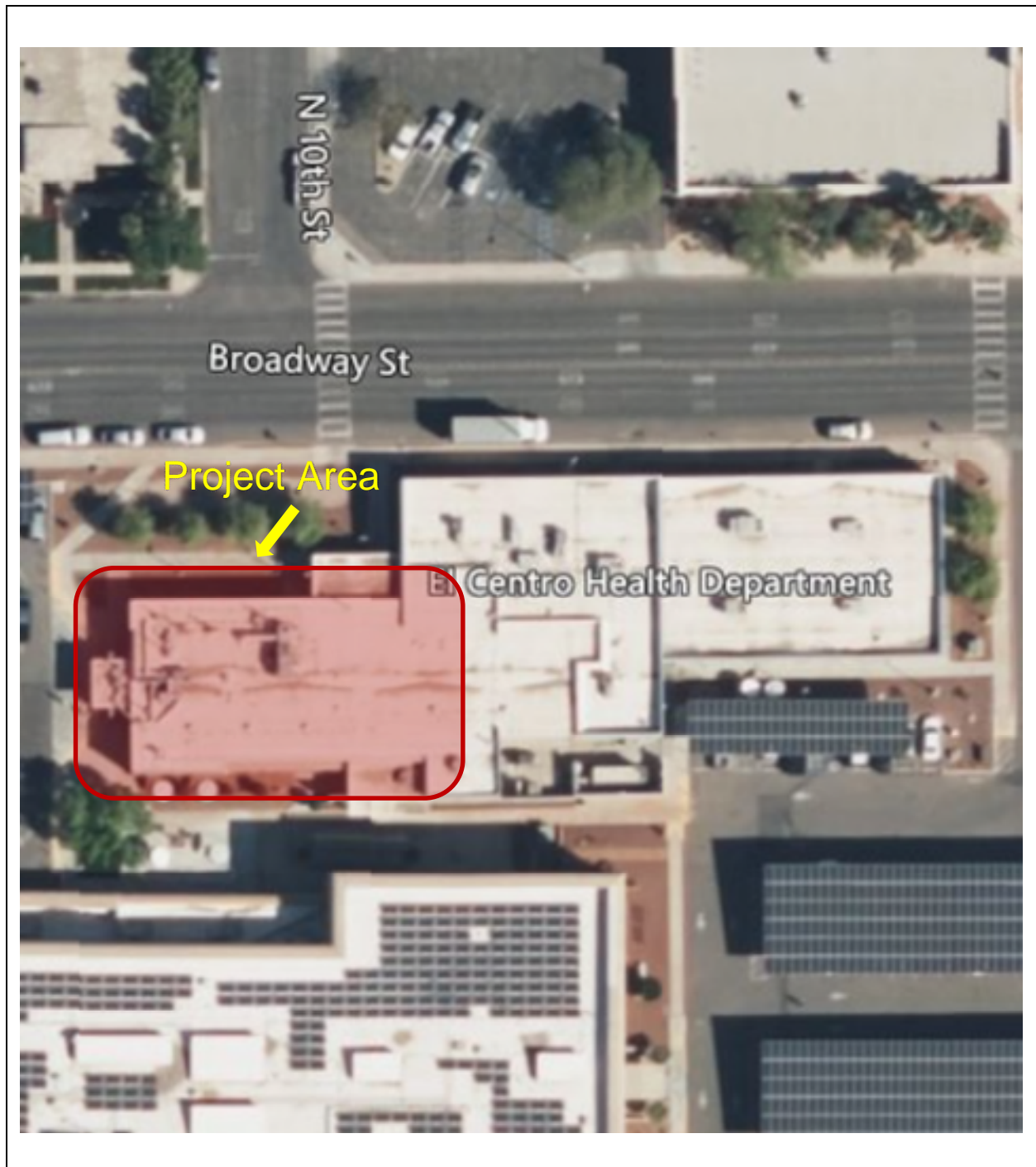
EXHIBIT B – LOCATION MAP