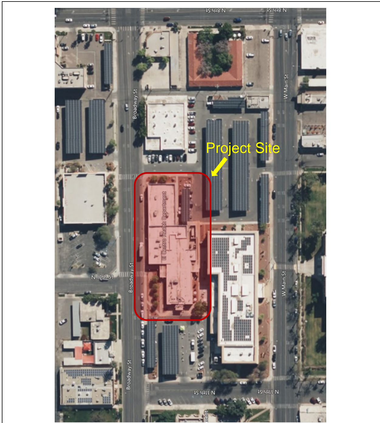
EXHIBIT A – VICINITY MAP